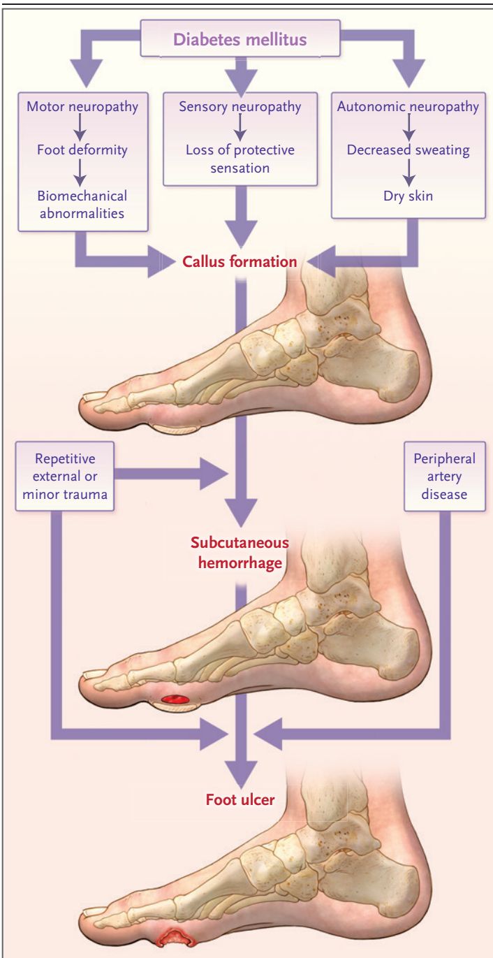
Figure 1. Common Pathway of Diabetic Foot Ulcer Occurrence and Recurrence. Diabetic foot ulcers and their recurrences are caused by a number of factors that ultimately lead to skin breakdown. These factors include sequelae related to sensory, autonomic, and motor neuropathies.

hospital admissions among patients with diabetes were either for ulcer care or for amputation. 18